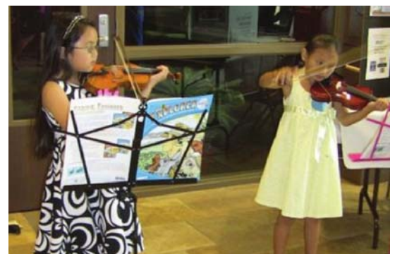
Talented young musicians playing violin