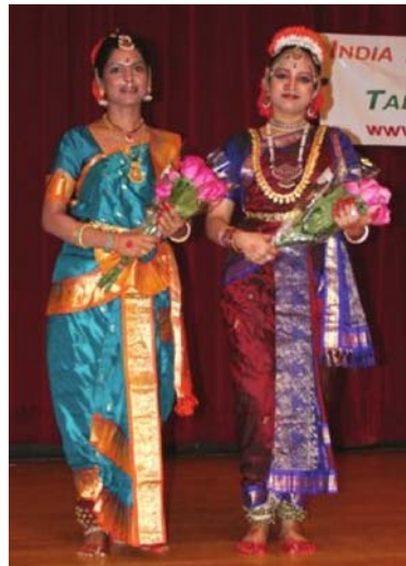
Indian Classical dancers