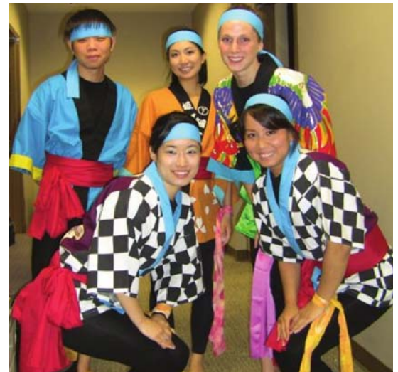
Dancers from Japanese Community of Tallahassee